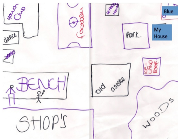
Map 1: It's Our Bench!